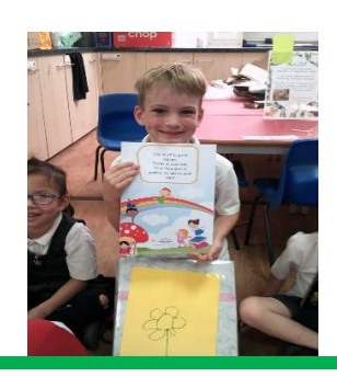
Children sharing their favourite book allows them to express their feelings and views and to understand that people can have different views and opinions.